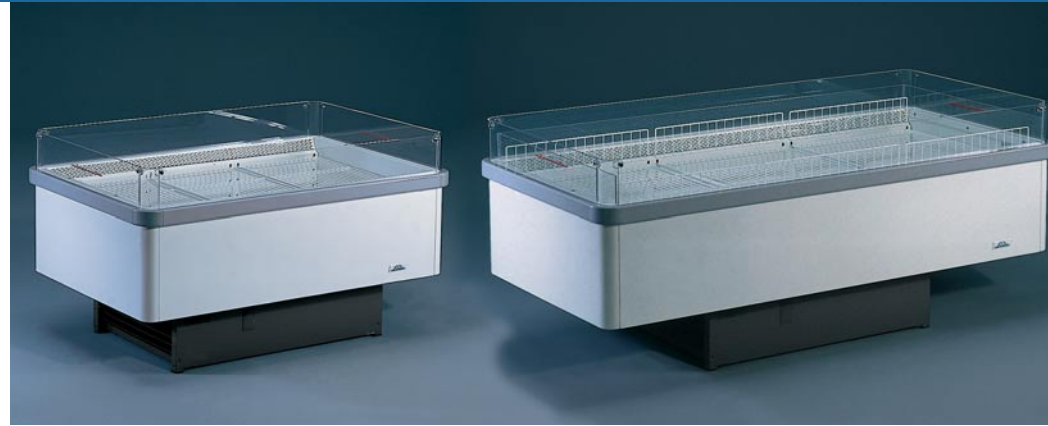
Visor 1535 Visor 1545 Length: 1480 mm