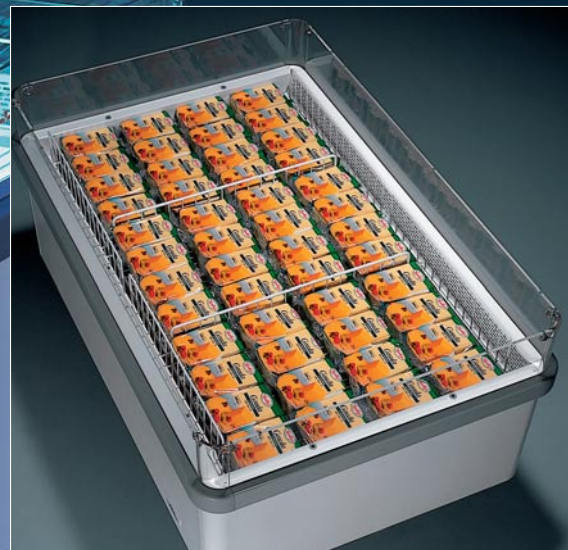
Visor ..35 version (2°C to 6°C) specially suited for self-service display of delicatessen items, cheese and other dairy products.