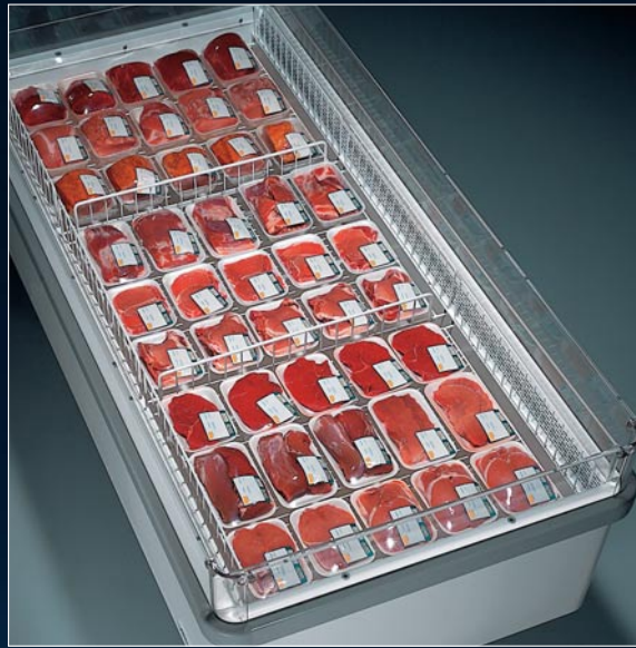
Visor ..45 version (0°C to 2°C) specially suited for reliably refrigerated self-service display of fresh meats.