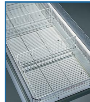
Front-to-back wire dividers and wire display racks.