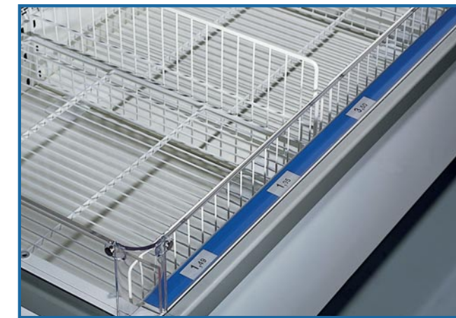
40 mm scanner price marking rail on long sides