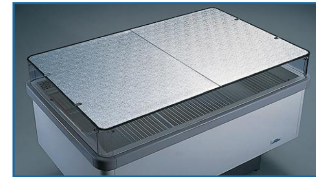
Night cover (standard)