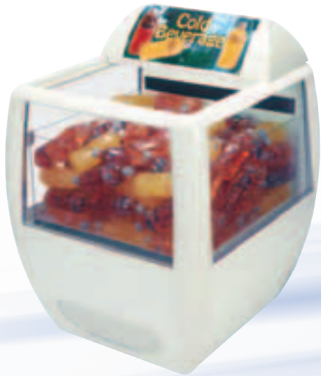
TC17 Lightbox is optional